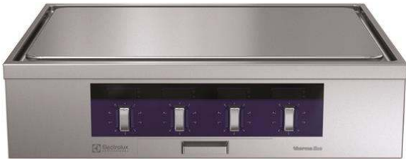
588009 (MALDAAHOAO) Electric solid top, 4 zones, ecotop coating one-side operated